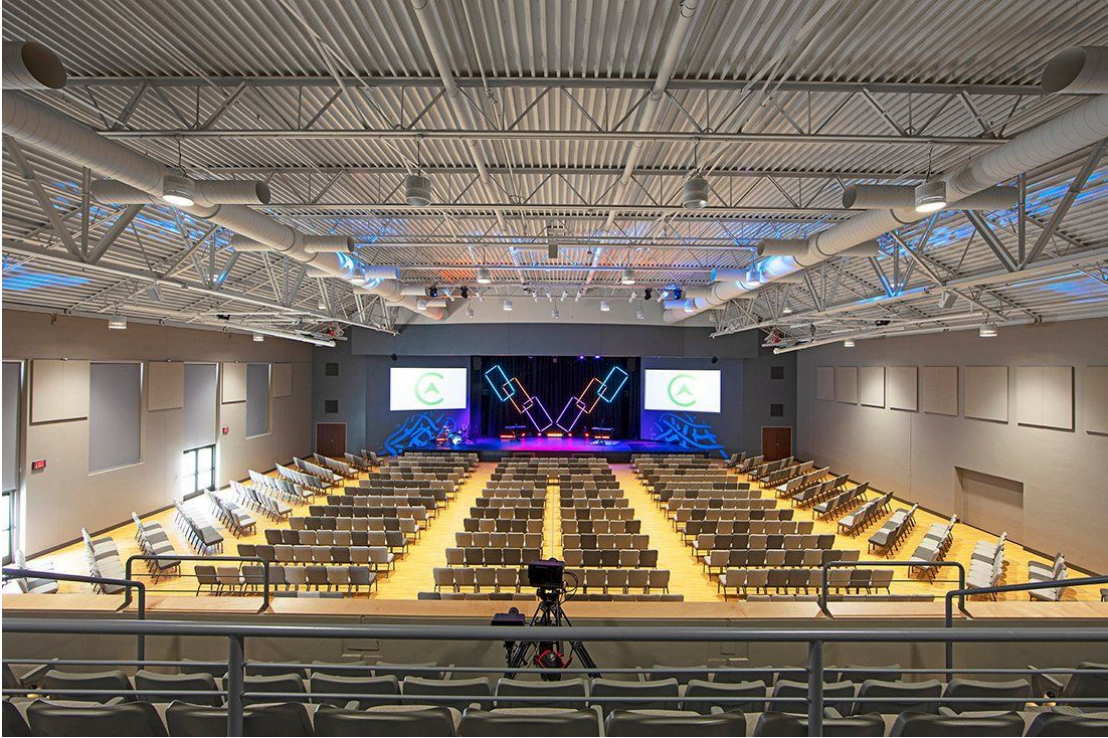
Lower Gathering Area –